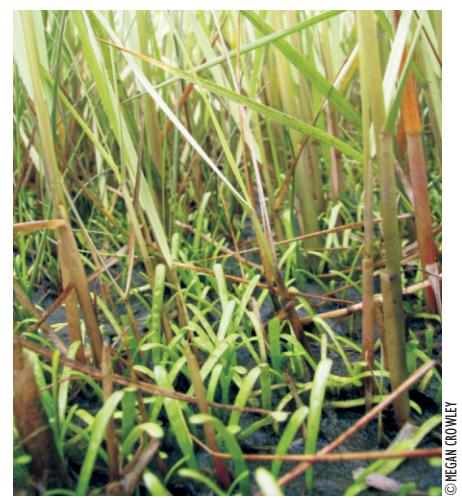
Growing under Saltwater Cordgrass

Eastern Lilaeopsis does not form rosettes; its leaves attach to the rhizomatous stem individually.